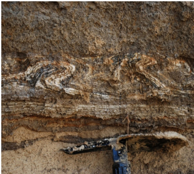
Steven A. Austin

In determining what the eclipse looked like, Waddington took into account other phenomena that physicists have studied related to the appearance of the sun or the moon at sunset. These phenomena are well known and may be observed on any clear evening. The first is that the moon or sun appears somewhat oblate due to the refraction of the earth's atmosphere. The second is that, because there is more atmosphere for the sun's or moon's light to go through at sunset, the shorter blue wavelengths are filtered out, resulting in the familiar red color of either celestial body at this time. In the case of an eclipsed moon, there would be the extra darkness of the earth's shadow on the face of the moon. Further, some of the light reflected back from the moon would